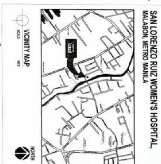
VICINITY MAP SCALE NTS